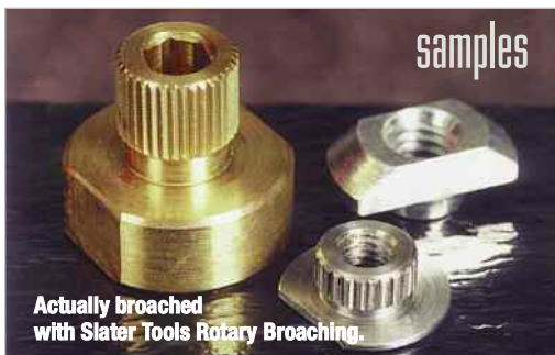
Actually broached with Slater Tools Rotary Broaching.